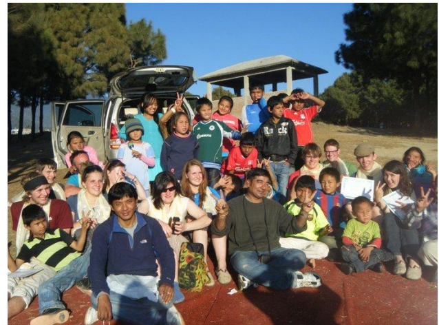
Final day picnic with the orphans Dec 2010

THE ADVENTURE The TEAM will plan and organise the whole adventure and other than the community project, will decide exactly when to go, for how long, and what you wish to do, including a minimum of 5 days on the community project. The Team will also have reports and recommendations from the 2010 team to work with. On the adventure side you could go trekking into the Annapurna Sanctuary from Pokhara, or heading up past Namche Bazaar to Gokyo Ri within sight of Everest, or into the Langtang Valley..... or even doing a shorter trek to Gorepani and Poon Hill within sight of the Annapurnas and Machhapuchre with a few days on Safari in the Chitwan National Park (where there be Tigers!). Endless opportunities! The treks will be guided by Prakash, and fully supported by porters, so you only have to carry water and minimal gear.