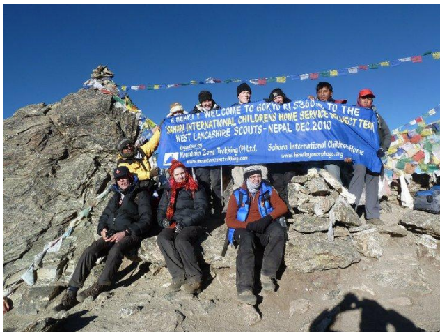
2010 Team on the summit of Gokyo Ri 5,357m

WHEN & FOR HOW LONG December 2012 – Roughly 9 th Dec – 2 nd Jan, Approx 22 days away